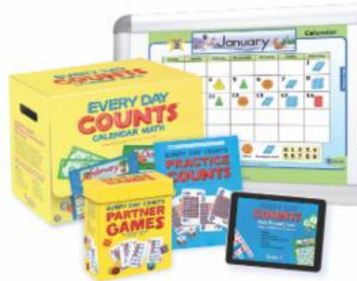
Calendar Math • Partner Games • Practice Counts Grades Pre-K–6