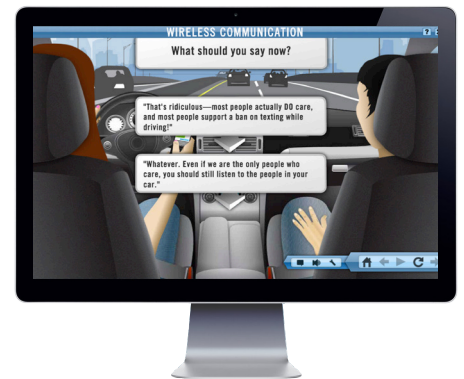
Wireless Communication Activity